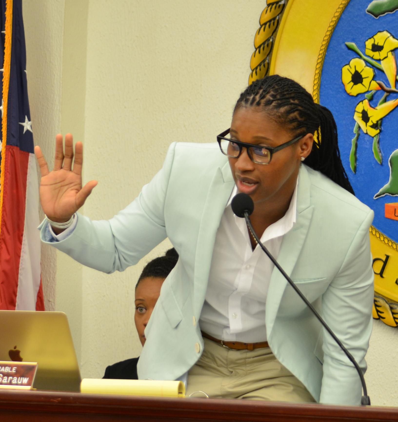
Senator Sarauw swearing in Testifiers during Committee on Workforce Development Hearing